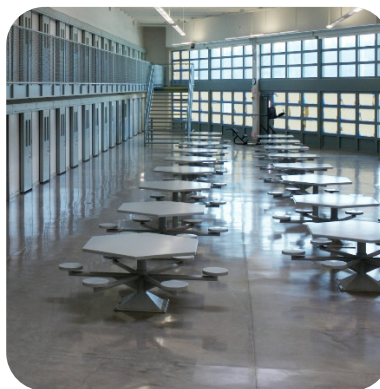
HEALTHY COMMON AREAS