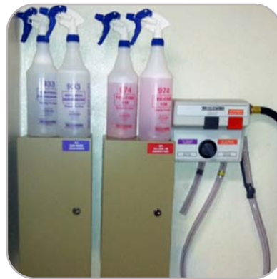
LOCKING DILUTION CENTERS

Surtec Laundry Programs Our laundry systems are turnkey programs that feature chemicals metered with peristaltic pumps for accuracy and safety. Surtec's Citrus Clean Laundry Detergent is a high quality liquid detergent formulated for use with automatic injection systems. Citrus Clean Laundry Detergent was developed with latest surfactant technologies and d'Limonene emulsifiers for superior cleaning under all water conditions. Leaves laundry with a clean fresh orange fragrance.