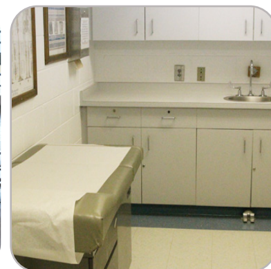
DISINFECTING EXAM ROOMS

Surtec Maintenance Equipment Surtec distributes a full line of maintenance equipment. Surtec's patented Acti-Vac Vacuuming System for high-speed buffers and the Polivac High-Speed side-to-side swing buffer with total vacuuming system and the capability of micro-filtration, provide improved indoor air quality.