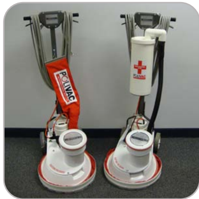
VACUUMING SWING BUFFERS