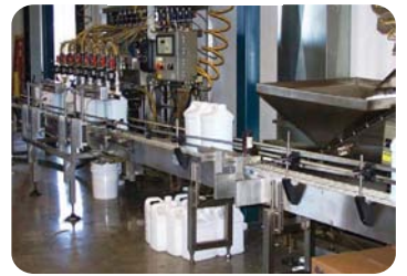
SURTEC CORPORATE OFFICES, RESEARCH & DEVELOPEMENT CENTER, MANUFACTURING AND DISTRIBUTION FACILITY