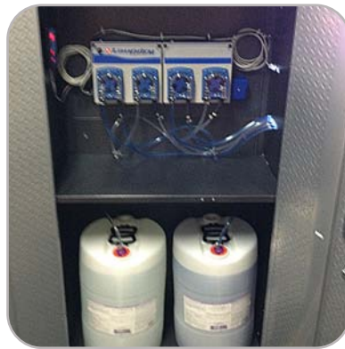
LOCKING DISPENSER SYSTEMS