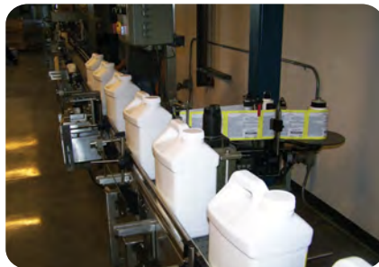
Surtec Automated Product Labeling