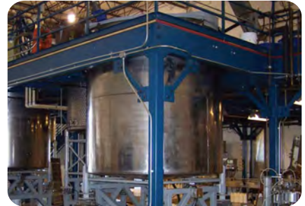
Surtec Chemical Manufacturing Area