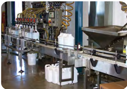
Automated Fill Line