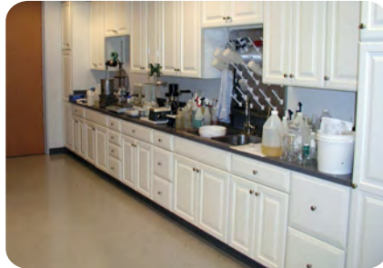
In-House Chemical Research & Development