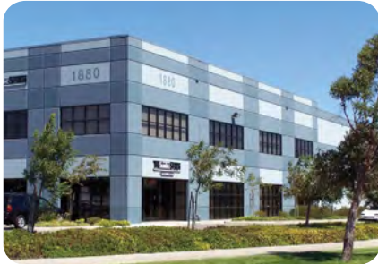
Corporate Office & Manufacturing Facility

Sustainable Cleaning Technology: The Ultimate in Green Cleaning Programs Green solutions that really work and cost less than traditional products