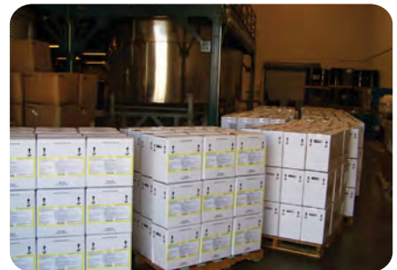
Five Gallon Twin Packs Ready for Shipment